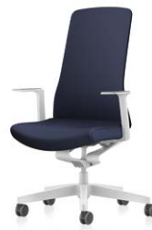
Swivel chair, upholstered backrest

PURE IS3 fits perfectly into any environment. Its clean-cut design and the large choice of colours and materials leave you free to customise your chair. The collection offers four swivel chair models: a mesh or upholstered backrest in either white or black. A variety of materials and colours are available to choose from. The Smart Spring, chair column and optional armrests are available in either all-white or all-black for all models. Choose between fixed T-armrests or 3D T-armrests; the fixed T-armrest impresses with its slim design, while the 3D T-armrest is exceptionally functional and height-, width- and depth-adjustable.