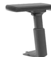
3D T-armrest, black