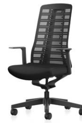
Swivel chair, mesh-covered backrest