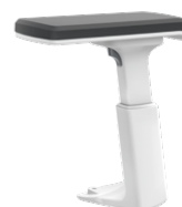
3D T-armrest, white