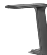
Fixed T-armrest, black