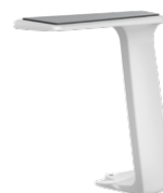
Fixed T-armrest, white

• As standard ◦ Optional - Not available